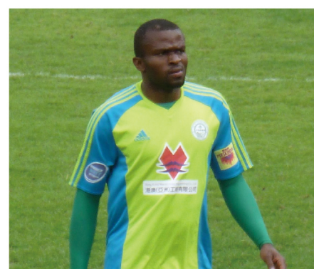
Caleb Ekwegwo (王卡立) (Image from wikipedia)